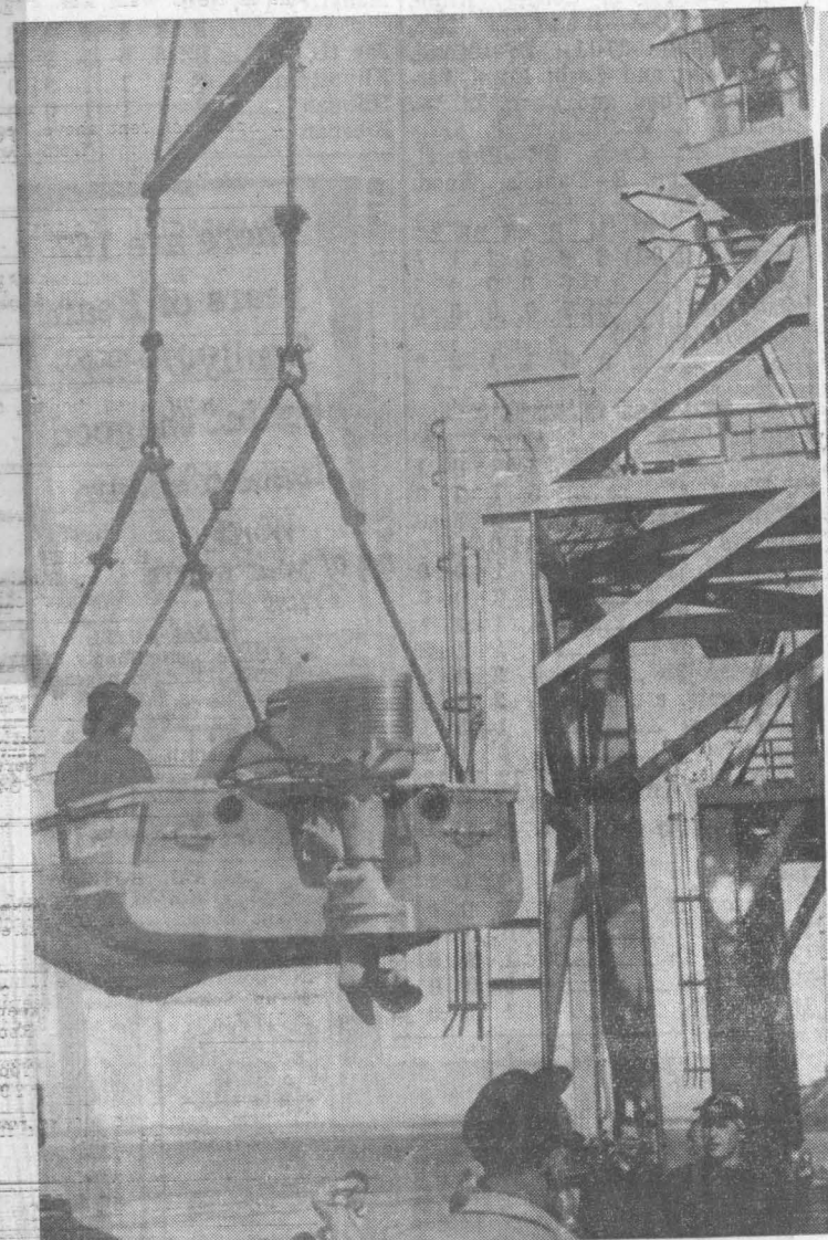
ALL BOATS were launched by one of the giant cranes at the Port of Anchorage. The skilled operator, upper right, was praised by all members for his handling of the boats.