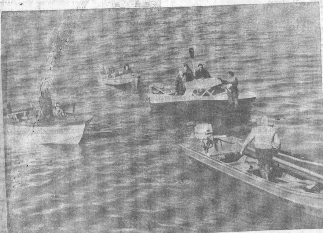
AFTER THE CRUISE the varied fleet meets in rendezvous off the city dock. Among the most unusual craft to complete the outing was the 30-foot Yukon river boat at the right.

The two hour cruise is the only activity of the organization formed last year to publicize the opening of the Port of Anchorage.