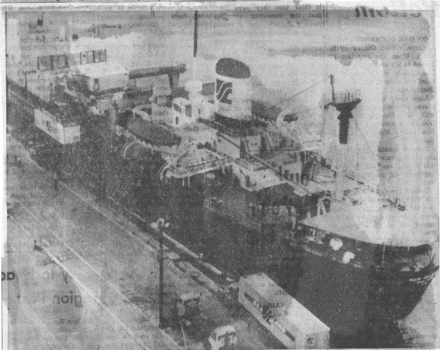
THIS WILL be the scene at the Port of Anchorage Municipal Terminal today when the SS New Orleans arrives on her first sailing to Anchorage from Seattle. The ship is in the

fleet of Sea-Land Service, Inc., the port's new contract carrier. With it and a sister ship, the company plans weekly, year-round service to Anchorage.