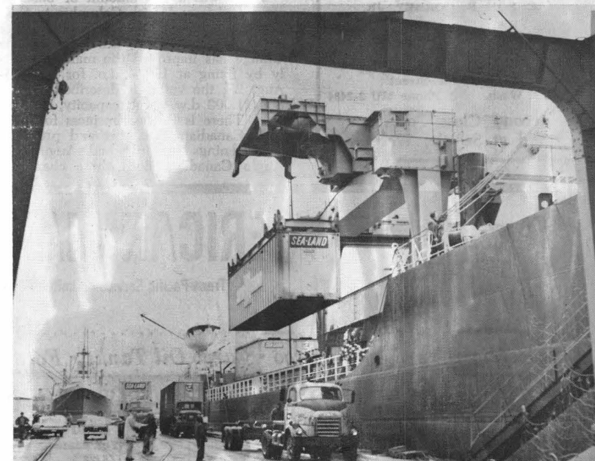
Sea-Land cargo van is lifted by special ship's gear aboard the SS New Orleans for the first voyage to Alaska in the new Seattle-Alaska service of Sea-Land Service, Inc.

SEATTLE — Sea-Land Service, Inc., began its Seattle-Alaska service with a special sailing from here Tuesday night. The ship SS New Orleans, loaded full, was due to arrive in Anchorage today, May 9.