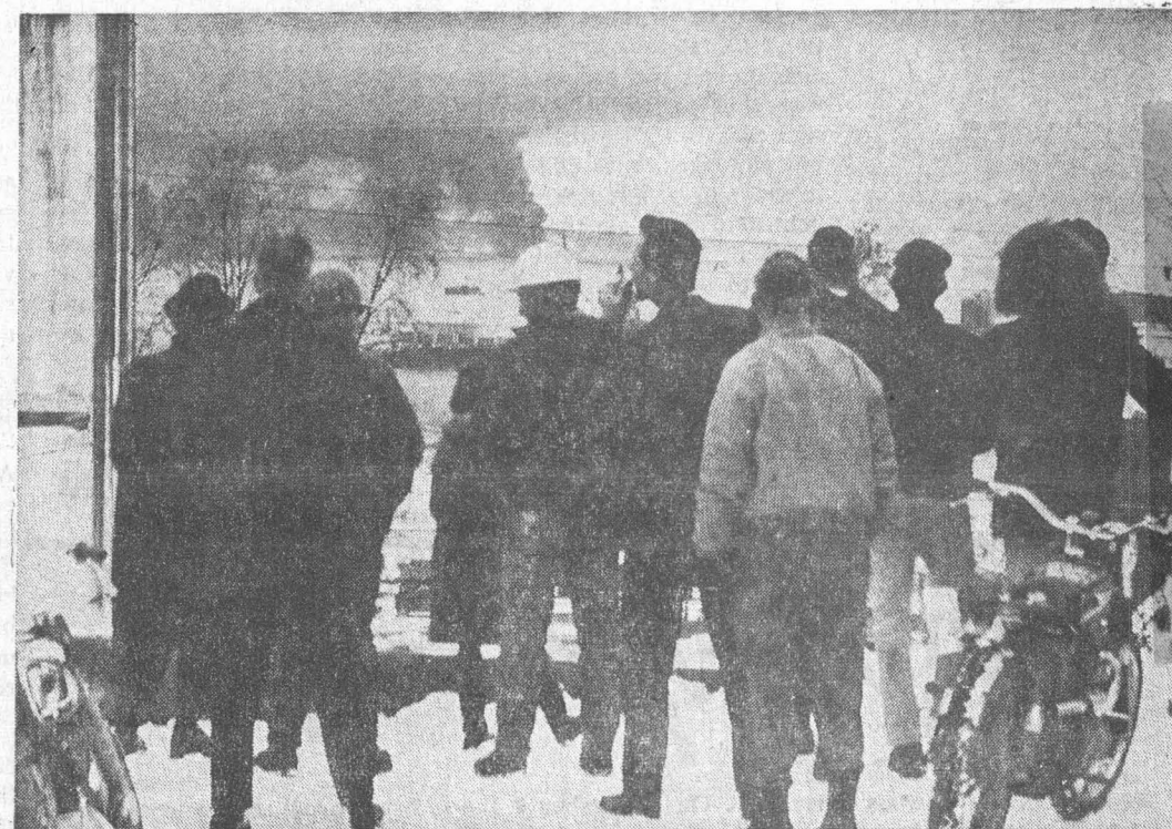
A KNOT of fascinated spectators stand on a hill overlooking the flaming finish of the tanker "Santa Maria." The thick oil smoke could be seen from all parts of the Anchorage area from just after 4 p.m. until darkness.