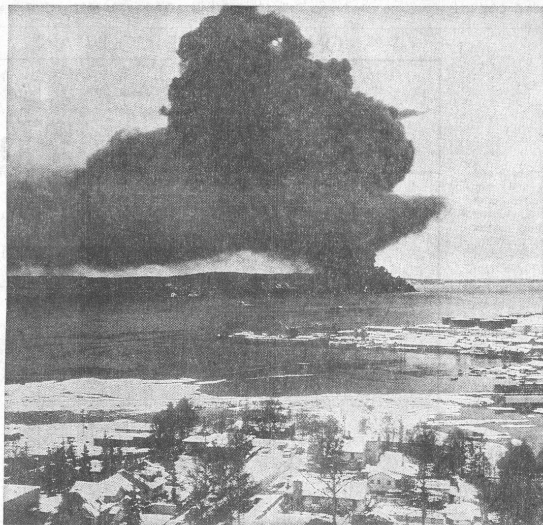
SHROUDED IN black smoke the burning tanker Santa Maria provides an unfamiliar element to the Anchorage skyline from the Top-of-the-World cocktail lounge in the Anchorage-Westward Hotel. Barely visible at left center is the tanker Sirrah which collided with the Santa Maria.