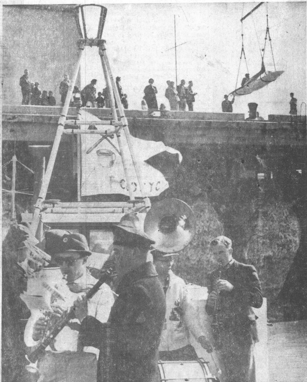
ANCHORAGE DOCK sang with music and activity Sunday during the Chester Creek Outfall Sewer Yacht club's annual regatta down Cook Inlet. A local German band plays stirring yachting music as the Lora K leaves the dock and a one-man sailboat (which did not complete the

cruise) is lowered to the water. A crowd of nearly 200 was on hand to watch seven small boats and the seismic crew barge cast off. The cruise went from the Port of Anchorage to Point Warranzof and return.