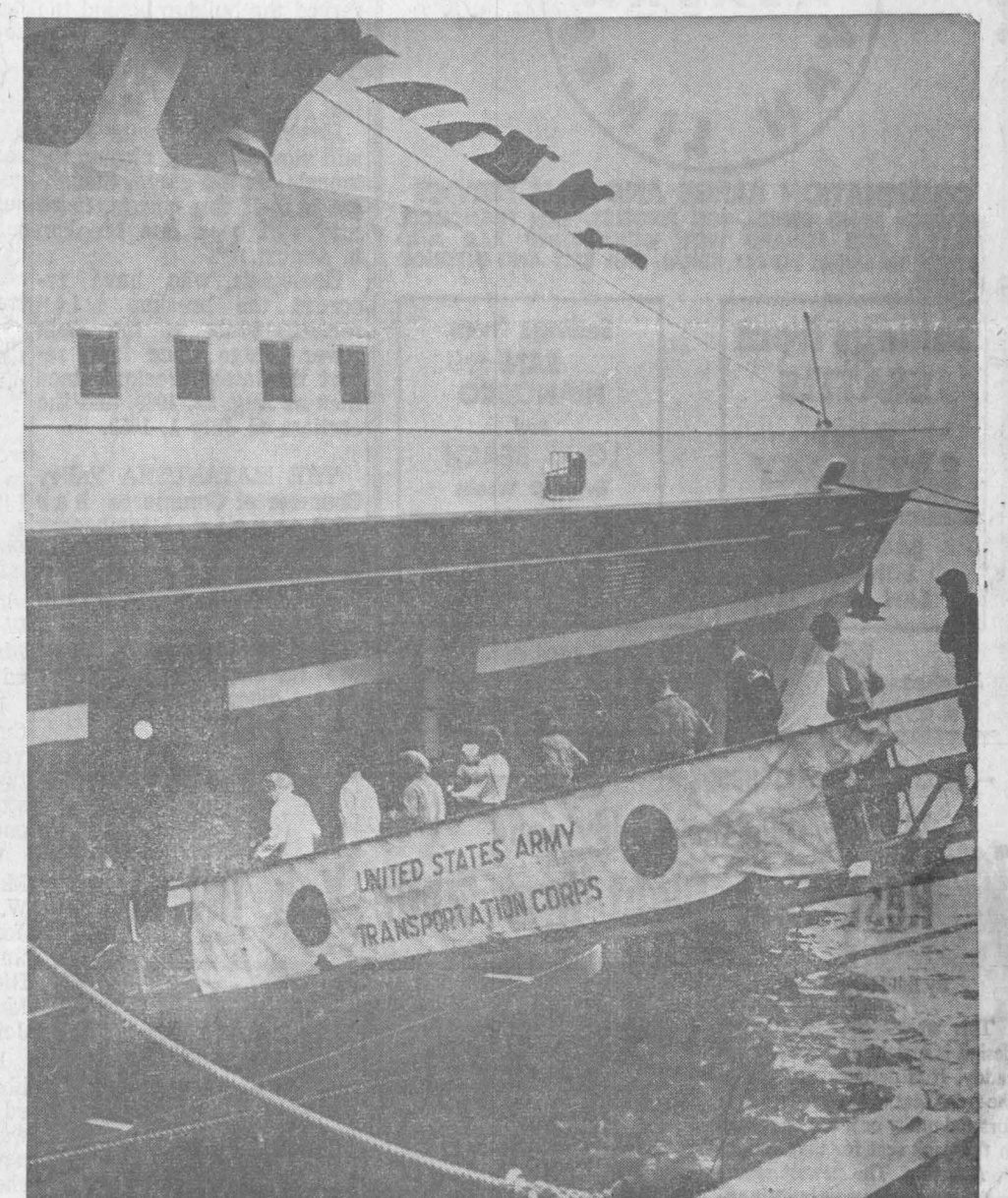
CROWD ENTERS FERRY FOR INSPECTION