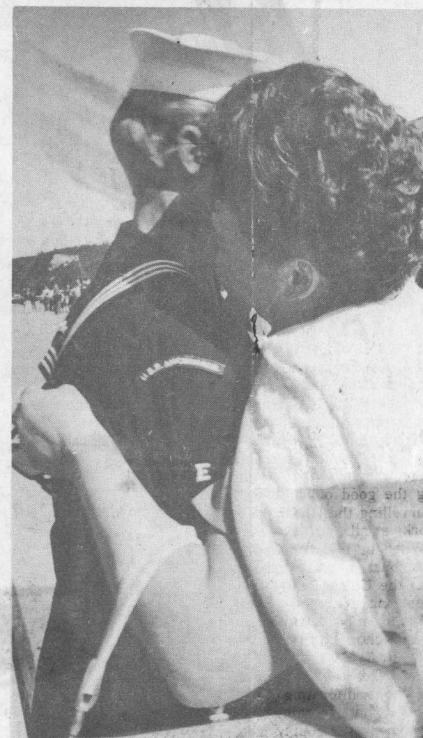
Warm Welcome Greets Sailor

when he arrived on the USS Anchorage Saturday. He is the only local boy to serve on the ship named after Alaska's largest city.