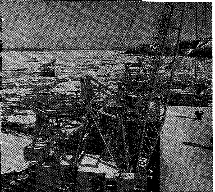
PORT OF ANCHORAGE WINTER OPERATIONS — ICEBREAKER APPROACHING DOCK THROUGH THE INLET'S EVER-SHIFTING WINTER ICE FLOES.