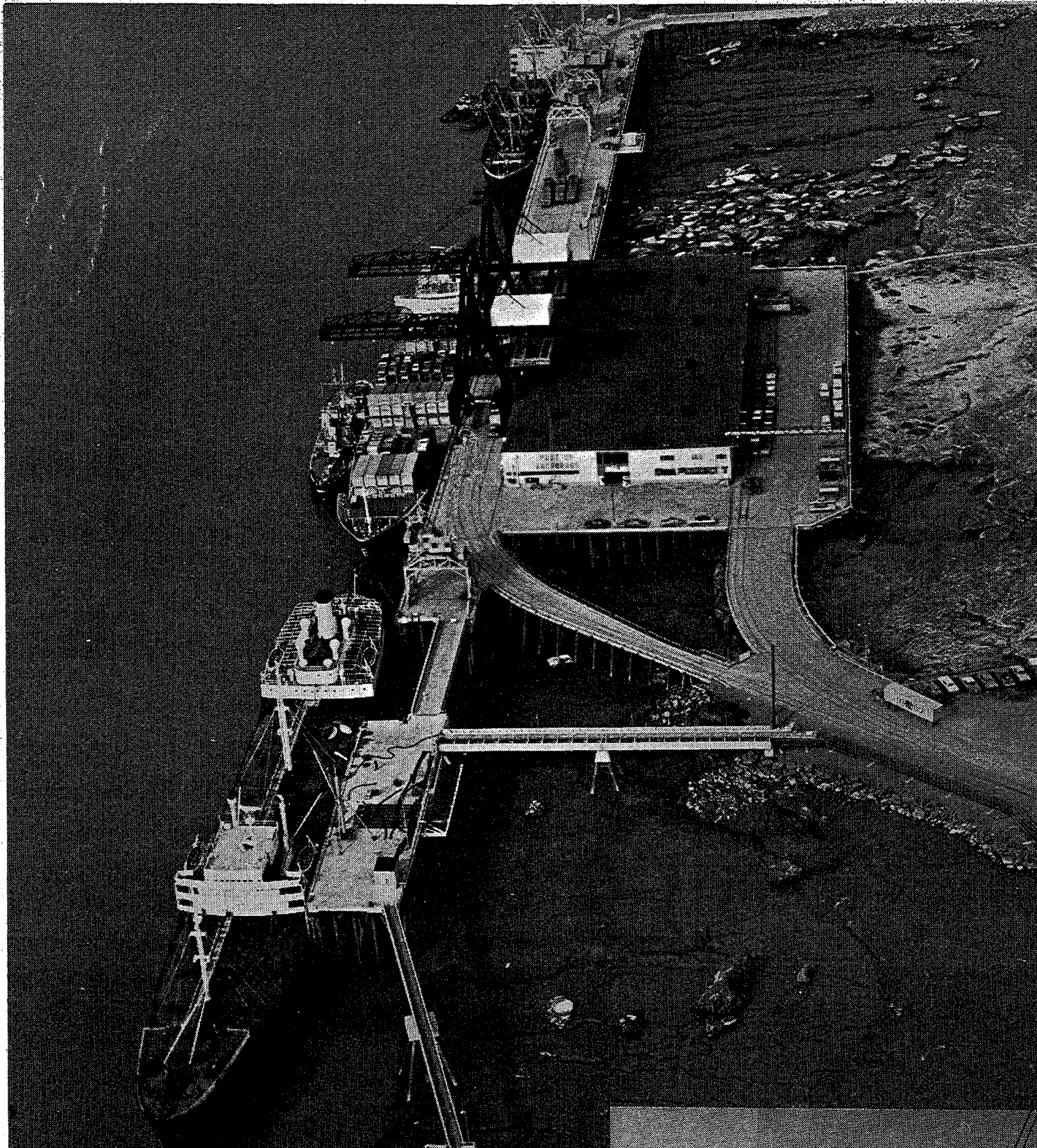
BROKEN ICE LIES ONLY A FEW YARDS AWAY—A MUTE REMINDER OF A WINTER JUST PASSED.