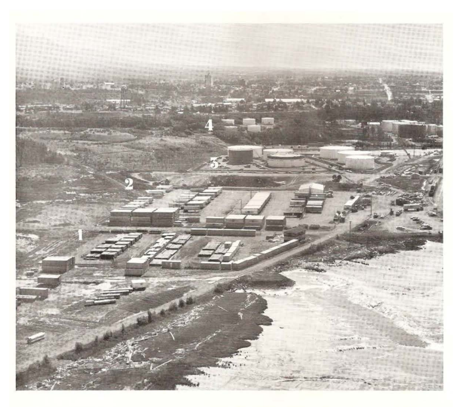
Pictured above: No. 1—Trans-World Alaska: No. 2—Sea-Land Service, Inc.; No. 3—Texaco, (under construction); No. 4—Shell Oil Company, with City of Anchorage and Chugach mountains in the background.